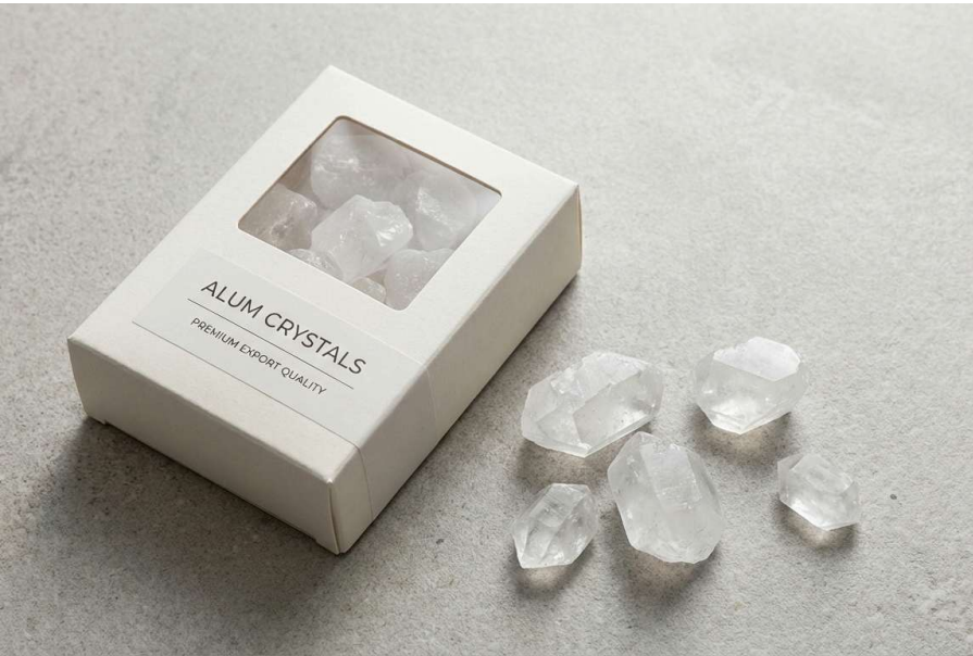
Alum crystal structure / processed forms