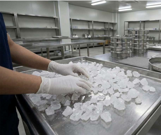
Mineral handling and grading process

Each batch is checked for size consistency, cleanliness, purity, and texture uniformity before packaging approval.